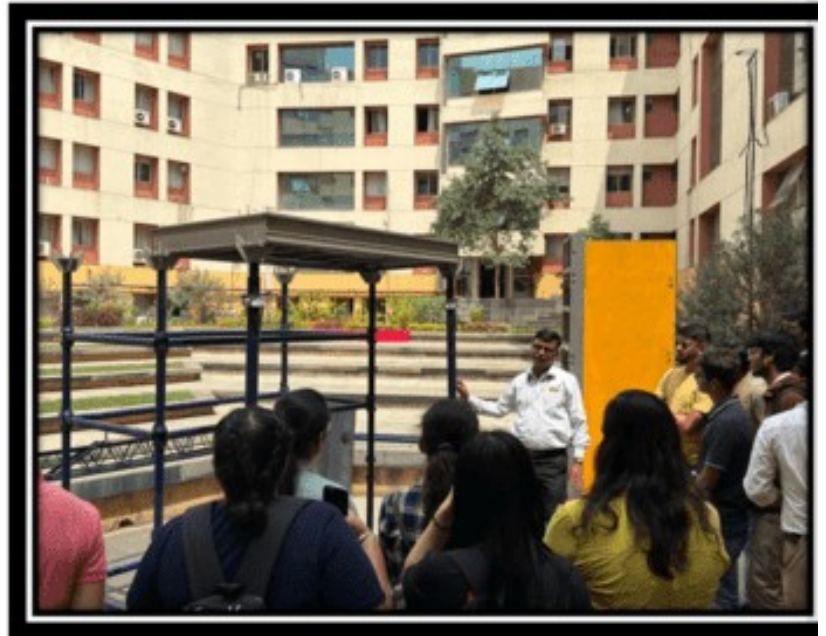
NBA Committee visit to Project Lab, Civil Engineering Department, SIT Pune